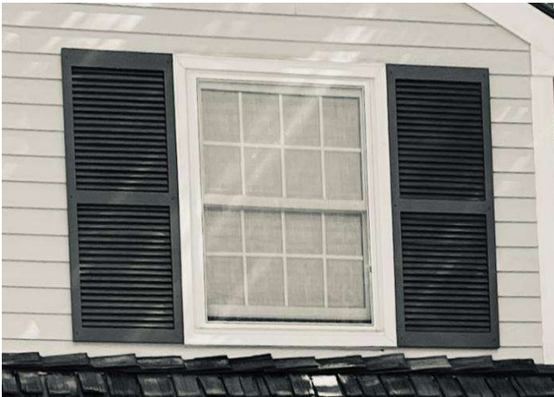
Window with correct sized shutters