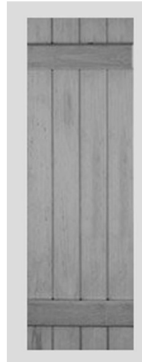
Board & Batten