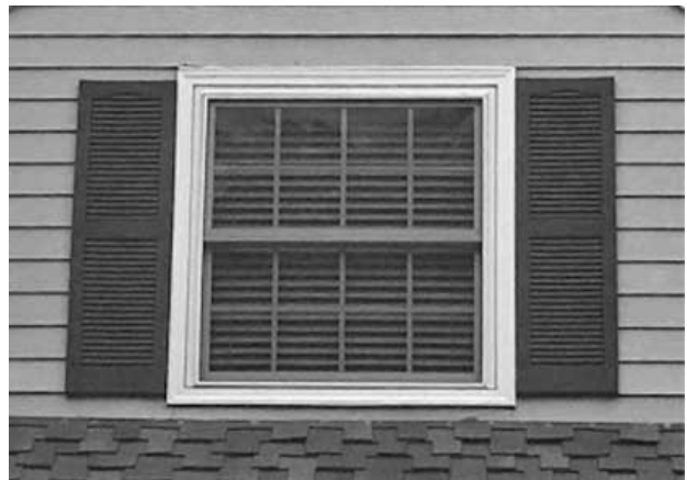
Window with incorrect sized shutters